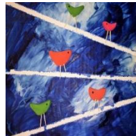
Birds on a Wire