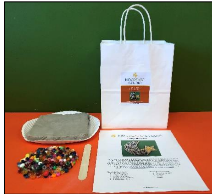
Example of an Art Kit

Note: This photo is missing the disposable apron that is included in every kit.